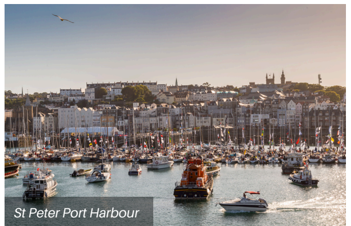
St Peter Port Harbour