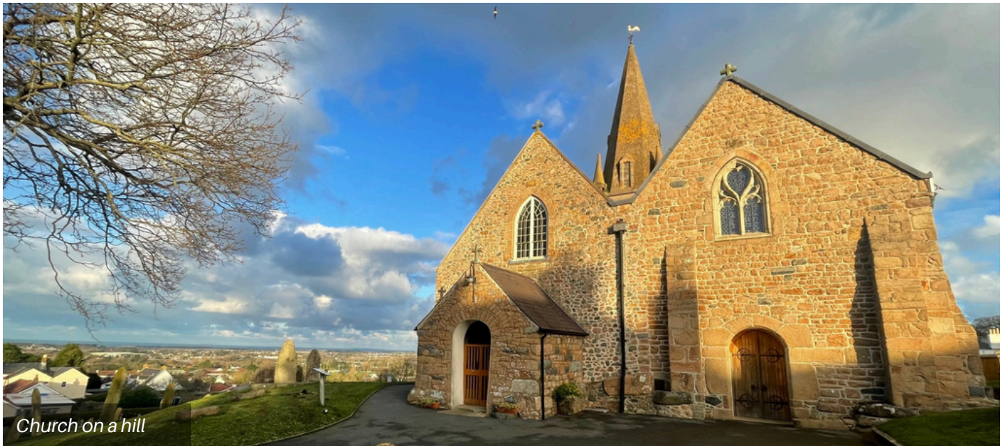
Church on a hill