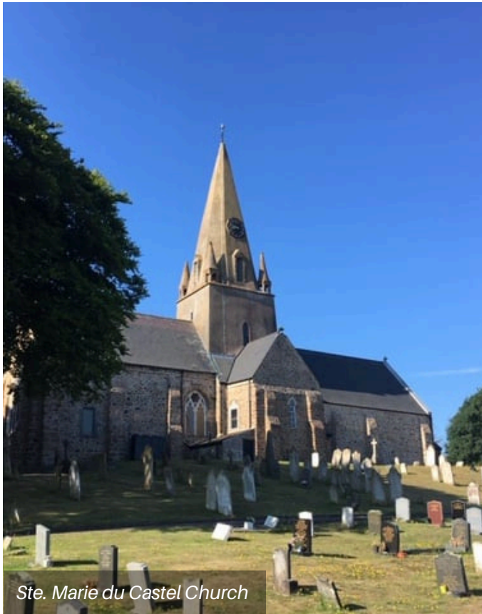
Ste. Marie du Castel Church