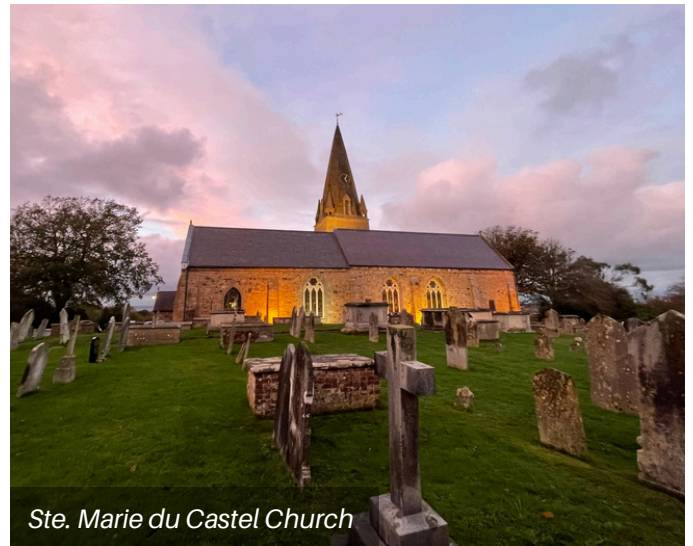
Ste. Marie du Castel Church

The church building and grounds are carefully maintained by a paid sexton and a committed team of volunteers. Alongside preserving its historic character, the church has invested in modern facilities in recent years, including an accessible toilet, refectory area, carpeted play space, restored organ and an up-to-date audiovisual system. These facilities support both worship and community use, enabling the building to serve the needs of all ages.