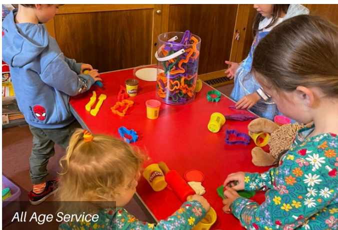
All Age Service

Occasional concerts are held in the church, and retiring collections have provided support for charities such as Aid to Ukraine, Parkinson's Guernsey and Cancer Research.