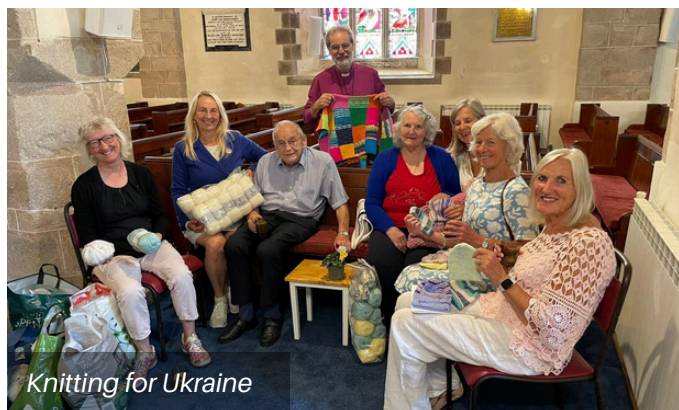
Knitting for Ukraine