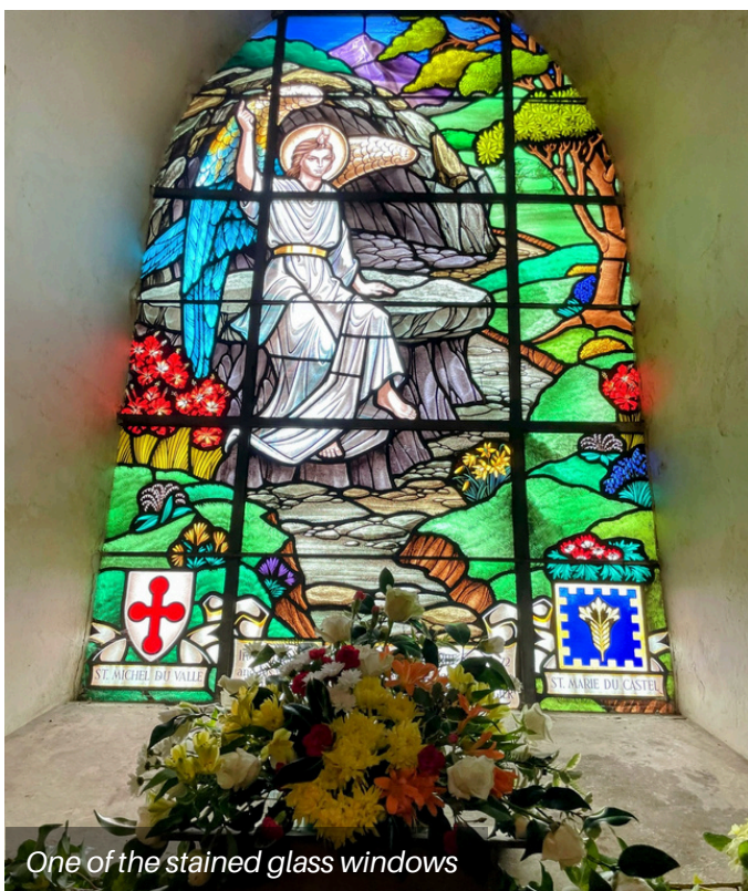
One of the stained glass windows

Sainte Marie du Castel is a Crown Living within the Deanery of Guernsey and the Diocese of Salisbury. The parish follows diocesan guidelines, with particular attention to safeguarding, stewardship and mission, and values cooperation and mutual support within the wider church.