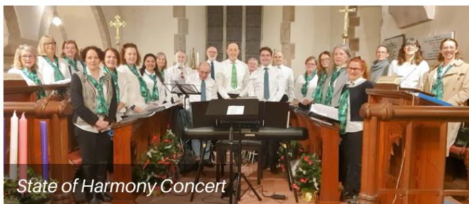
State of Harmony Concert