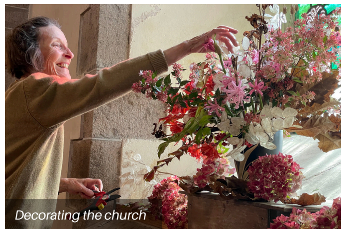
Decorating the church