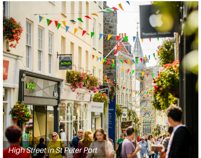
High Street in St Peter Port

We look forward to taking forward this vision for the parish with the new incumbent.