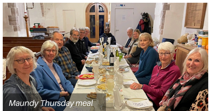
Maundy Thursday meal