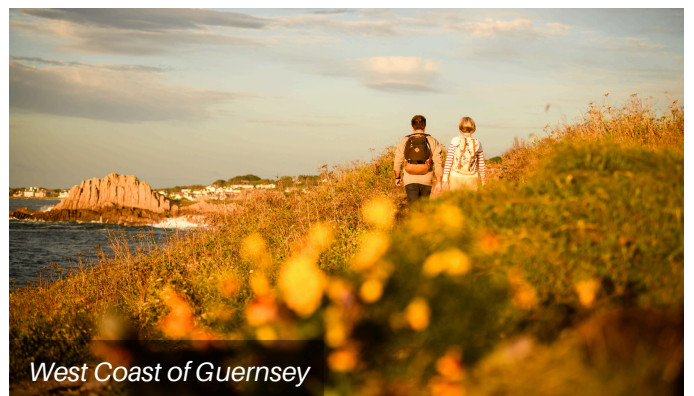
West Coast of Guernsey