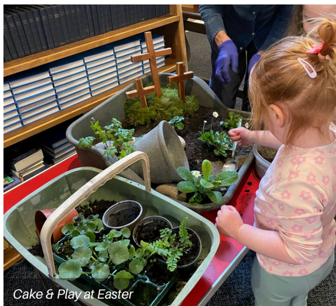
Cake & Play at Easter