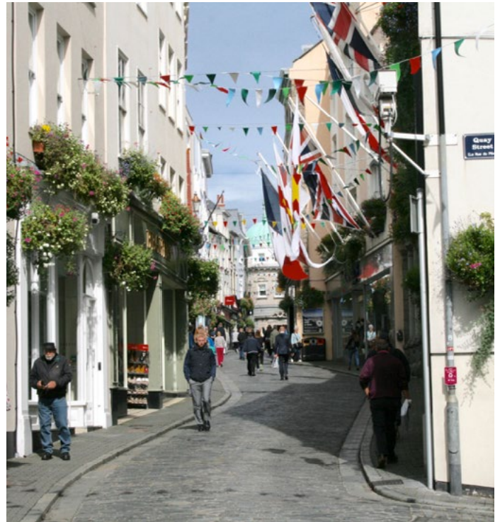
Guernsey Ecclesiastical Boundaries

There are no PCCs in Guernsey and the legal responsibility for each parish church rests with its Rector or Vicar and the Churchwardens. The nearest PCC equivalent is the Advisory Committee which meets regularly as required, the level of authority given to each Advisory Committee is decided by the priest and Churchwardens.