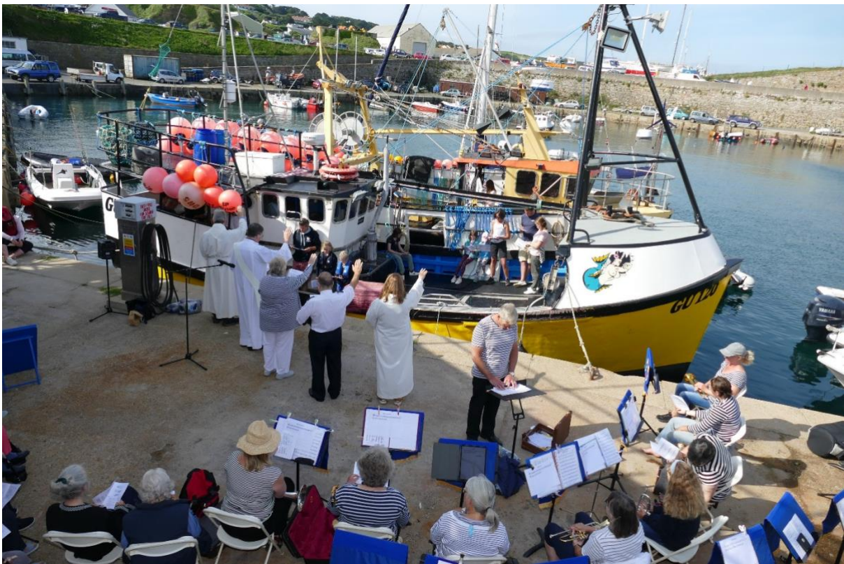
The blessing of the boats in Alderney's harbour

A team of trained Lay Pastoral Assistants provide care to members of the congregation and the wider community who are in need of support and help.